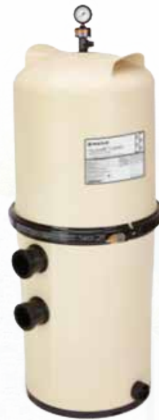
C620, F72 & Q120 MODELS