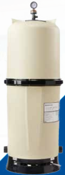
FV60 & FV72 MODELS