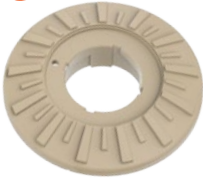
Full Color Plastic