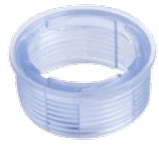
Clear Flush Fitting