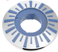
Stainless Steel Color Accent