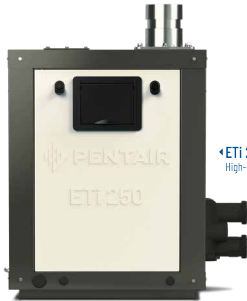
◀ ETi 250 High-Efficiency Heater