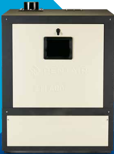
ETi 400 High-Efficiency Heater