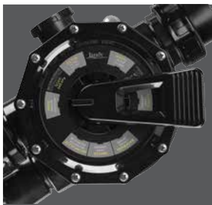
7-position multi-port valve for 2" plumbing (SFTM24-2.0)