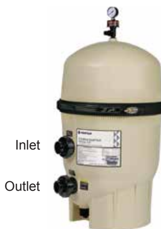
Clean & Clear Plus Filter

Clean & Clear Plus Filters have a corrosion resistant injection molded filter tank featuring strength and reliability. The cartridge assembly uses four easy to clean, non-woven, polyester cartridges. Each filter is supplied with a bulkhead union set for easy installation.