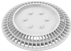
FIGURE 1 – SOFA MODEL & FLOW PATH