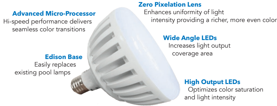
Shown: LXG-W Pool Lamp

With five solid color and seven lights shows, instantly transform any pool or spa into a custom illuminated paradise. These LED Pool and Spa Replacement Lamps install in minutes and offer the ideal ambiance for playing, relaxing or entertaining, while providing immediate energy cost savings.