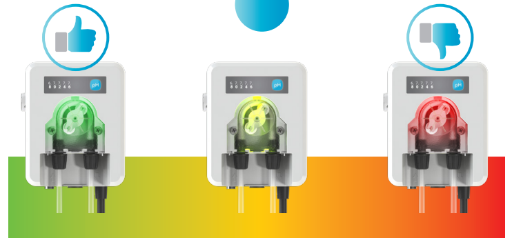
IDEAL MEASUREMENT (<0.1)