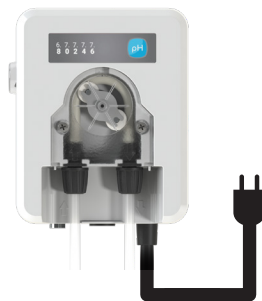
< 5 FT >

The Phileo VP is the easiest pH regulator system to install on the market. Plug the Phileo VP into any protected 120V outlet. From there, the flow rate sensor captures the filtration status and gives you a more reliable indication. For an even easier setup, it's possible to add a measurement chamber, which houses all the accessories necessary to treat your pool water in a single location, including a sensor, chemical injector, and flow monitor.