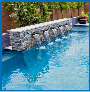
ON/OFF Pump Control