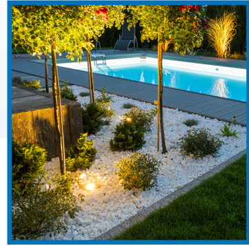
General Purpose Auxiliary Loads

Remote Input Enhance functionality by wiring a photocontrol/presence sensor (120-277 VAC) directly to the PE700 Series control, then apply an override to the chosen circuits. This means that the override can handle much larger loads as it now allows the control to handle the load directly while there is very little draw on the override itself.