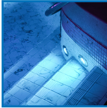
Submersible Lighting Control