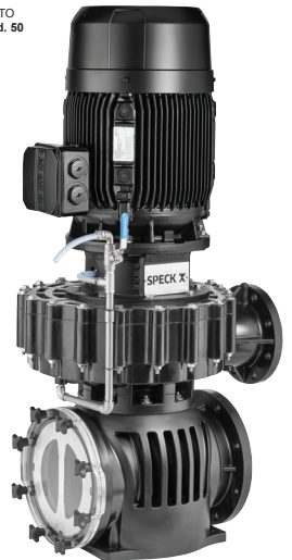
BADU Block Multi 125/250