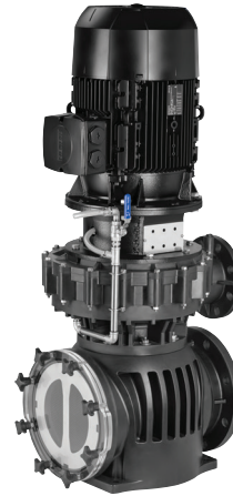
BADU Block Multi 100/250