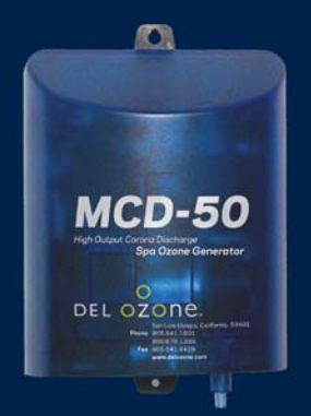
MCD-50 Up to 1000 gal.