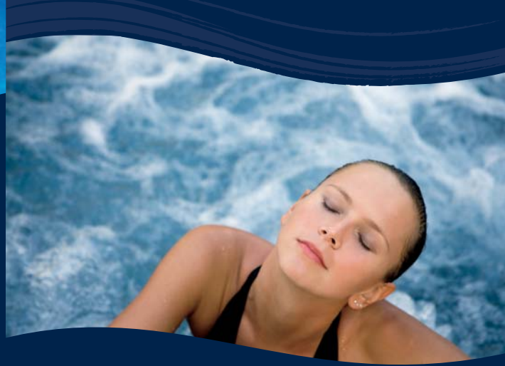
O DEL OZONE natural spa sanitation

SPA OZONE SANITATION REDUCE CHEMICAL USE 60-90%