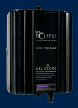
Spa Eclipse Dual Voltage Up to 500 gal.