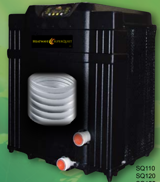
SQ110 SQ120 SQ155 SQ175