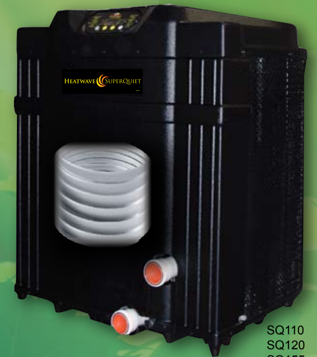
SQ110 SQ120 SQ155 SQ175