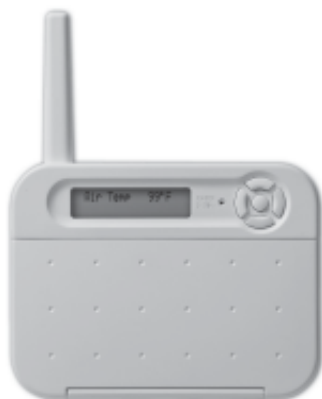
wall mount model