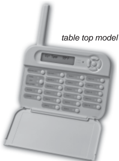
table top model