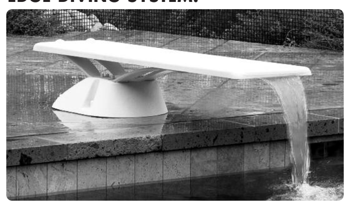
Part # EDGE-BASE (6' & 8' Edge Fiberglass Base & Jig) Part # EDGE-SPRING (6' & 8' Spring Assembly) See page 117 for paver jig info. Compatible with Epoxy Mounting Kit Part # EPX-5