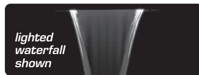
lighted waterfall shown