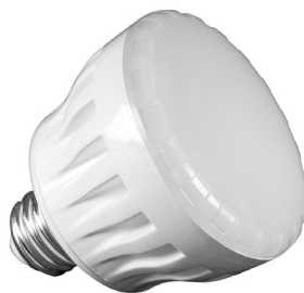
LED Spa Replacement Lamp