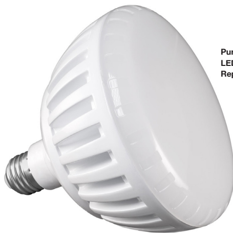
PureWhite Pro LED Pool Replacement Lamp