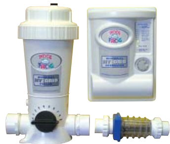
Mineral Hybrid Combines Benefits of 2 Technologies for Complete Pool Care