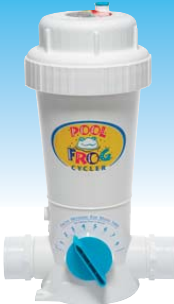
In Ground Mineral System