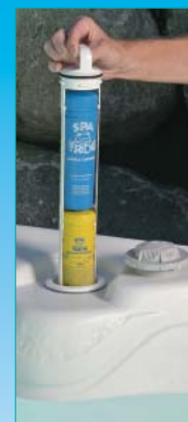
In-Line Mineral System Built In by the Spa Manufacturer for New Spas