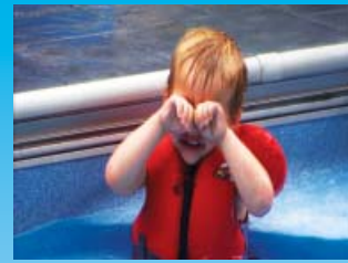
NO RED EYES