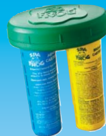
Floating Mineral System Floats in Any Spa