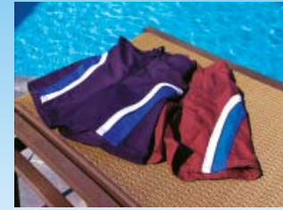
NO FADING SWIMSUITS