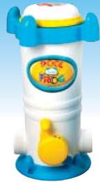
Above Ground Mineral System