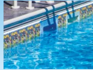
EASIER ON POOL SURFACES