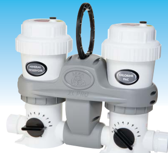
XL PRO In Ground System with X-tended Pac Life