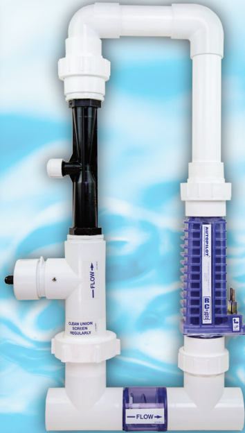
Pool Pilot® Digital Nano with CoPilot® & RC-35/22 Manifold Recommended for Pools up to 40,000 gallons/150 m 3