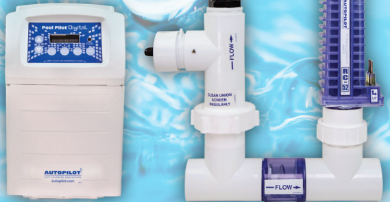
Pool Pilot® Digital with CoPilot® XL & RC-52 Manifold Recommended for Pools up to 85,000 gallons/320 m 3

Upgrade units available to retrofit any pre-existing Digital, Soft Touch, Digital Nano or Cubby Digital units