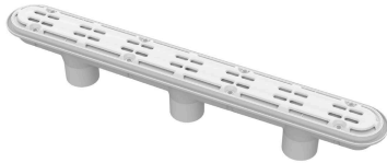
FIGURE 1 – SOFA MODEL & FLOW PATH