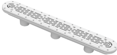
FIGURE 1 – SOFA MODEL & FLOW PATH