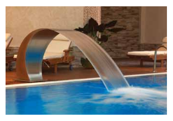
When it comes to moving more water faster and serving multiple features, you can count on the Challenger pump.