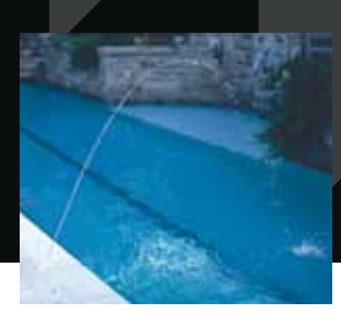
Single ¼" stream