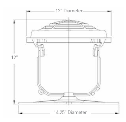
Fountain Fixture for large lights Part No. 560000 (Light sold separately)