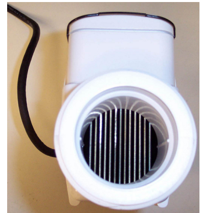
View of cell plates from top