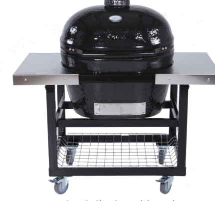
XL Oval displayed in Primo Cart with optional SS Side Tables