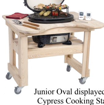
Cypress Cooking Station