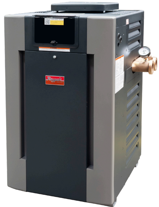
Digital model with outdoor top shown