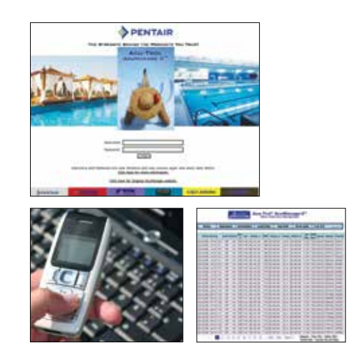
AcuCom and AcuManage Software