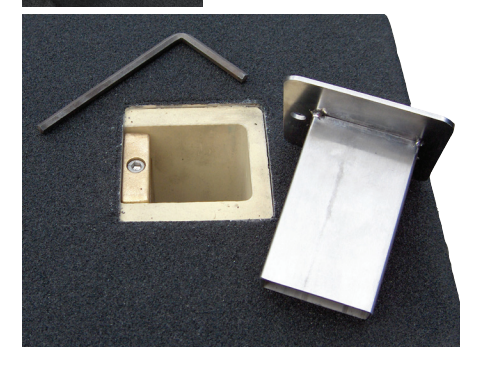
Item No. Description Shipping Wt. L W Н 27-107 RockSolid™ Anchor and Cap 8 lbs. 8" 8" 6" 27-108 RockSolid™ Dual Post Anchor 15 lbs. 25" 10" 3" 4-113-1 Standard Anchor Cap 1 lb. 20-191 Safe-T-Cap Anchor Cap 3 lbs. 8" 8" 6" 20-241 1 lb. Wedge Assembly