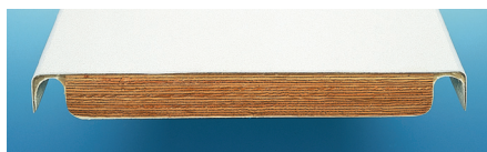
Frontier III Commercial