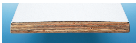
Eureka (14' only)