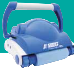
Kreepy Krauly® Prowler® 720 Robotic Pool Cleaner