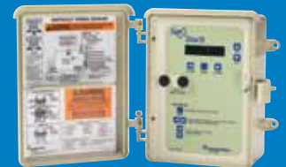
IntelliTouch® Indoor Control Panel