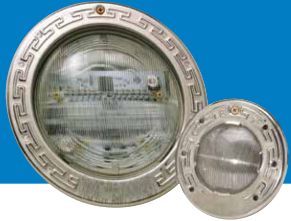
IntelliBrite® 5g LED Pool Lights

IntelliBrite® 5g LED (Light Emitting Diode) pool lights and IntelliBrite® LED spa lights are the most energy-efficient pool and spa lighting option available. Plus, they can last longer, minimizing replacement cost and disposal.