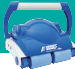
Kreepy Krauly® Prowler® 730 Robotic Pool Cleaner