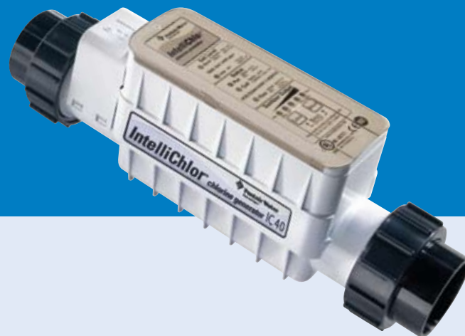
IntelliChlor® Automatic Chlorine Generator

Using only natural table salt, the IntelliChlor® automatic chlorine generator creates pure chlorine in your pool and eliminates the need to buy, store, and add harsh chlorine products manually. In effect, fewer resources are used in the production, packaging, and transportation of these chemical compounds.