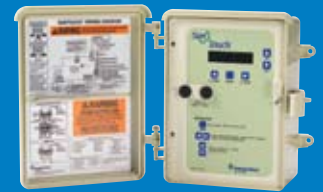
SunTouch® Automated Controls