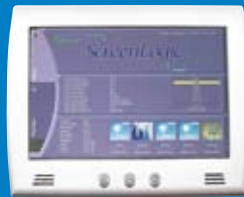
IntelliTouch® Automated Controls

Our control systems can optimize energy use and equipment performance by automating and synchronizing equipment scheduling. They prevent problems and waste so you don't have to rely on your memory or limited time clocks to operate or turn off equipment.