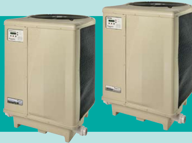
UltraTemp® Heat Pumps

When a heat pump is appropriate for your climate, it is the most energy-efficient heating option. UltraTemp® and ThermalFlo™ heat pumps transfer heat from the atmosphere to the pool or spa, saving up to 80% in energy costs compared to other heaters. Plus, they are charged with R-410A refrigerant, an environmentally safe, clean and non-ozone depleting refrigerant.