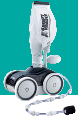
Kreepy Krauly® Legend® II Automatic Pool Cleaner