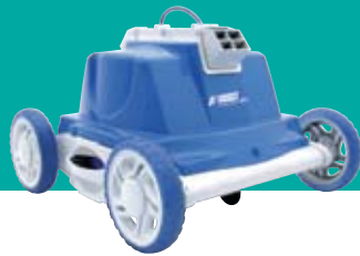
Kreepy Krauly® Prowler® 710 Robotic Pool Cleaner

The powerful Kreepy Krauly® Legend® II pressure-side pool cleaner and Kreepy Krauly® Prowler® robotic cleaners provide highly energy-efficient cleaning performance.