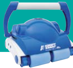
Kreepy Krauly® Prowler® 730 Robotic Pool Cleaner