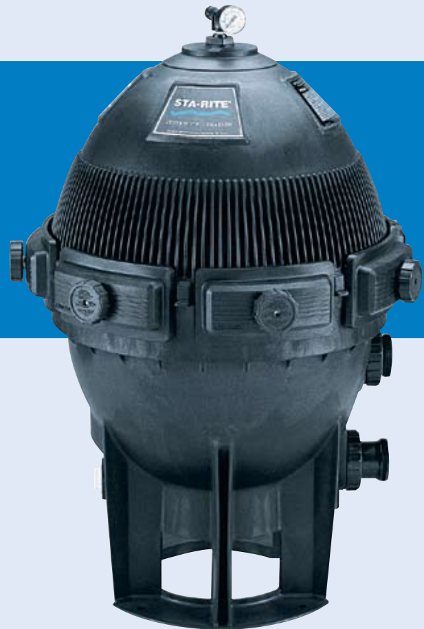
System:3® Mod D.E. Filters