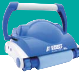
Kreepy Krauly® Prowler® 720 Robotic Pool Cleaner