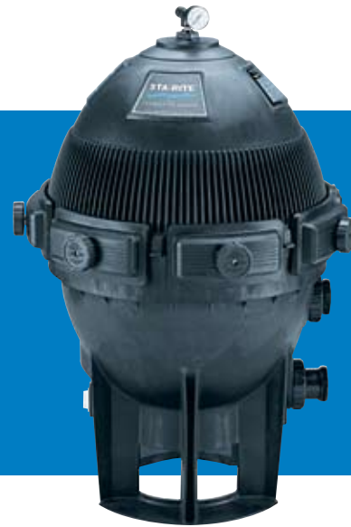
System:3® Mod Media™ Cartridge Filters

Water flows very efficiently through the System:3® Mod Media™ cartridge filters, often allowing the use of smaller pumps or lower pump speeds to minimize energy use. And when you rinse cartridges rather than backwash, you can significantly reduce water use, too.