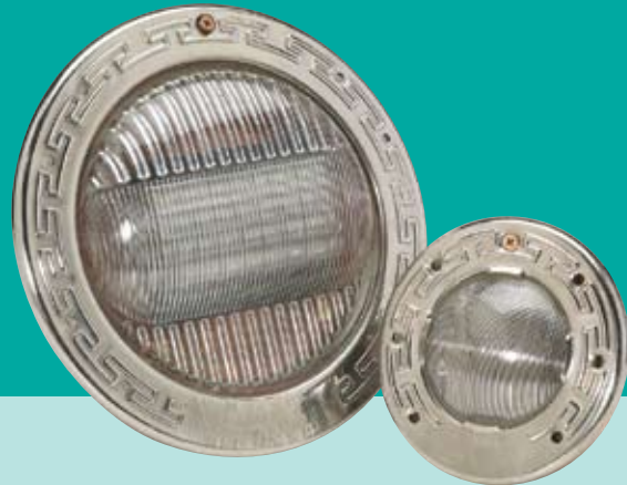
IntelliBrite® LED Lights

IntelliBrite® LED (Light Emitting Diode) pool and spa lights are the most energy-efficient pool and spa lighting option available. Plus, they can last longer, minimizing replacement cost and disposal.