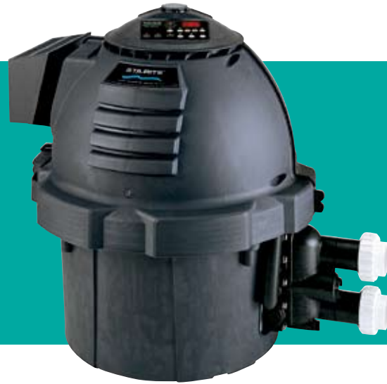
Max-E-Therm® High Performance Heaters

Max-E-Therm® high performance heaters offer best-in-class energy efficiency. Plus, they are certified for low NOx emissions, making them eco-friendly favorites.