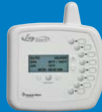
EasyTouch® Automated Controls