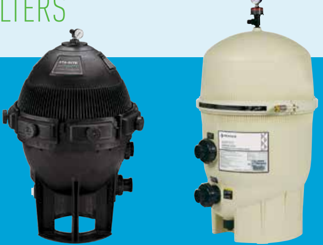
System: 3 Mod D.E. Filters

Water flows very efficiently through Quad D.E.® and System: 3® Mod D.E. Filters, allowing the use of smaller pumps or lower pump speeds to minimize energy use. And when you rinse cartridges rather than backwash, you can significantly reduce water use, too.