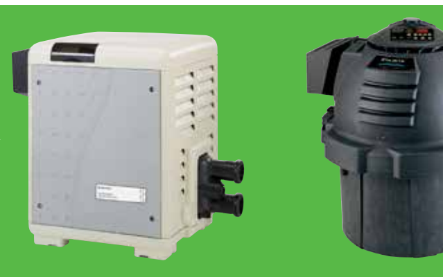
MasterTemp High Performance Heaters

MasterTemp® and Max-E-Therm® High Performance Heaters offer best-in-class energy efficiency. Plus, they are certified for low NOx emissions, making them eco-friendly favorites.