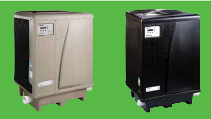
UltraTemp Heat Pumps

When a heat pump is appropriate for your climate, it is the most energy-efficient heating option. The UltraTemp® Heat Pump transfers heat from the atmosphere to the pool or spa, saving up to 80% in energy costs compared to other types of heaters. Plus, it is charged with R-410A refrigerant, a non-ozone depleting refrigerant which is safer for the environment.