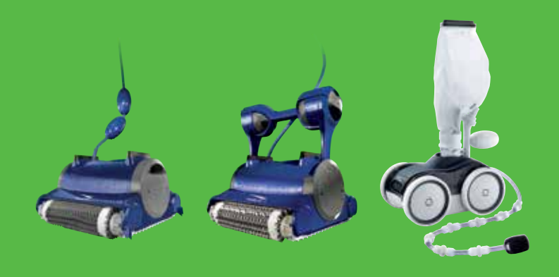
Kreepy Krauly Prowler 820 Robotic Pool Cleaner

The powerful Kreepy Krauly <sup>®</sup> Legend<sup>®</sup> II Pressure-side Pool Cleaner and Kreepy Krauly Prowler<sup>®</sup> Robotic Cleaners provide highly energy-efficient cleaning performance.