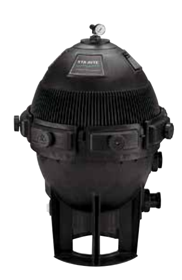
System: 3 Mod Media Cartridge Filters

• Chemical-resistant, fiberglass-reinforced polypropylene tank provides exceptional strength.