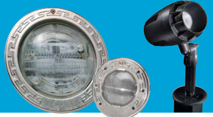
IntelliBrite 5g LED Pool Lights