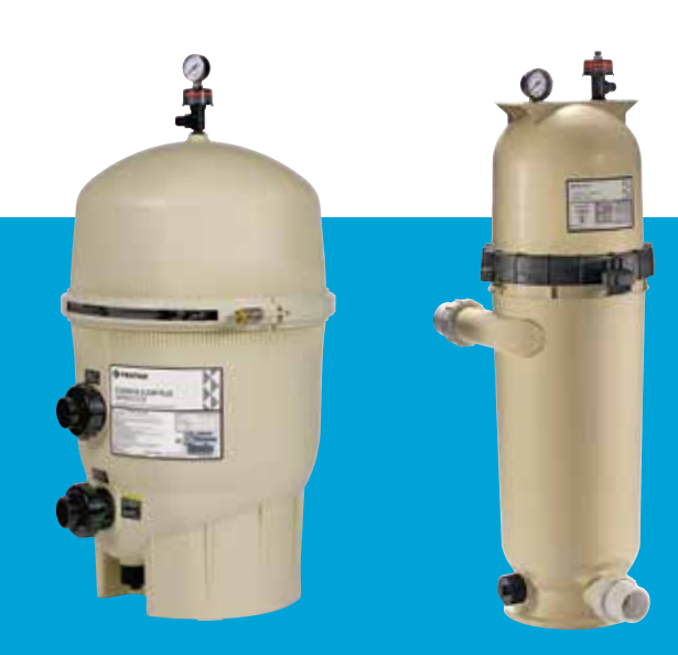
Clean & Clear Plus Cartridge Filters

Water flows very efficiently through the Clean & Clear® Plus, Clean & Clear RP, System: 3 Mod Media and Posi-Clear™ RP Cartridge Filters, often allowing the use of smaller pumps or lower pump speeds to minimize energy use. Plus when you rinse cartridges rather than backwash, you can significantly reduce water use, too.