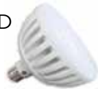
ColorSplash-LXGW LED Replacement In-Ground Pool Lamp