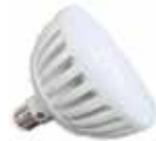
ColorSplash-LXG LED Replacement In-Ground Pool Lamp